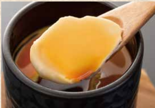
Hanami Egg Crème Brûlée 380yen

The handmade creamy pudding was made with luxurious original brand Hanami Eggs with a melt-in-your-mouth texture and rich flavor.