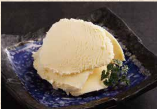
Vanilla ice cream 340yen

The handmade creamy pudding was made with luxurious original brand Hanami Eggs with a melt-in-your-mouth texture and rich flavor.