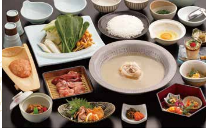
A picture is an image picture of "Hana course"