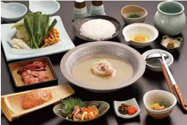
A picture is an image picture of "Aji course"