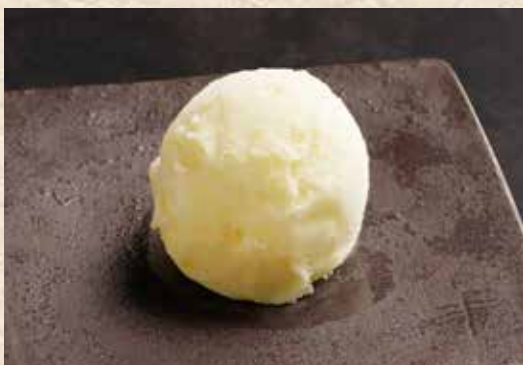
Yuzu Sorbet (including fruit pulp) 340yen

Citrus fruit sorbet with a refreshing aroma that offers smooth melt-in-your-mouth texture.